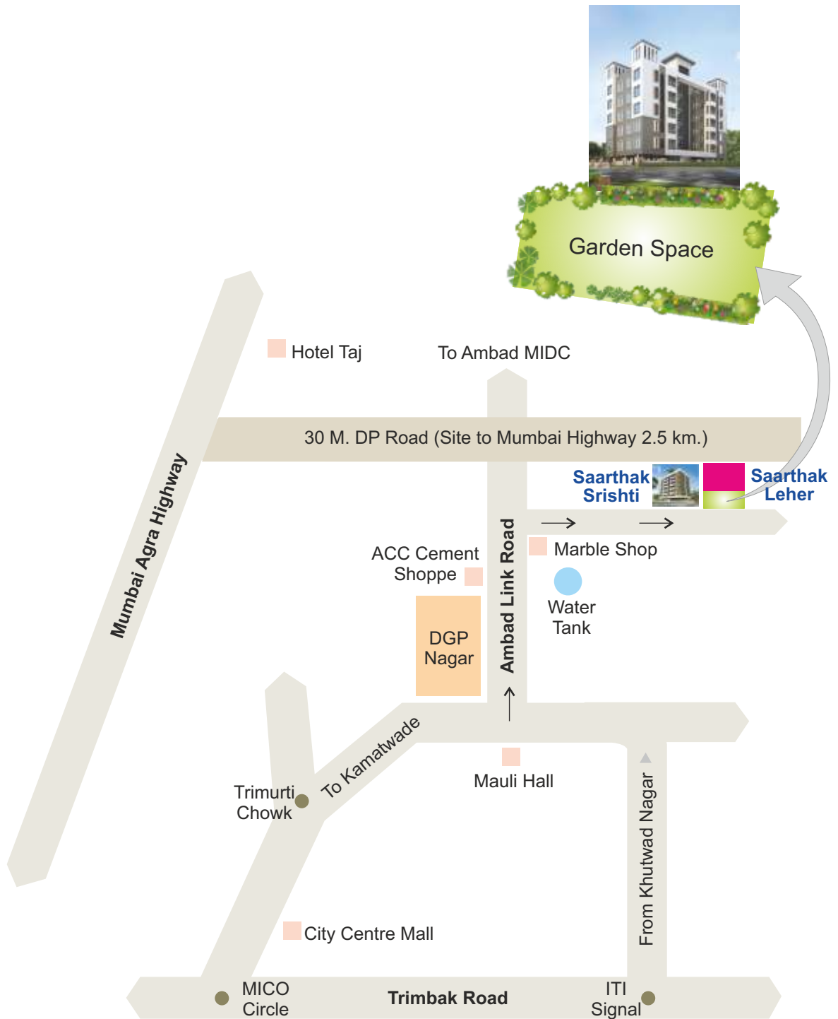
Site : Saarthak Constructions, Plot No. 4, S.No. 227, Opp. DGP Nagar, Ambad, Nashik.