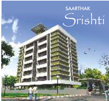
Luxurious 2 BHK Apartments Opp. DGP Nagar, Ambad, Nashik.