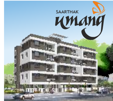
1 BHK Budget Apartments 100 Chunchale, Satpur-Ambad Link Road, Near Petrol Pump, Satpur, Nashik.