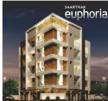
2/3 BHK Ultimate Luxury Serene Meadows, Gangapur Road, Nashik.